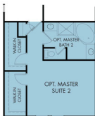
OPT. MASTER SUITE 2